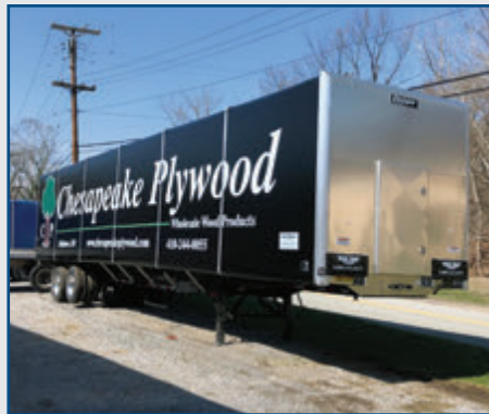
Our graphic department turns your Vango into a moving billboard!