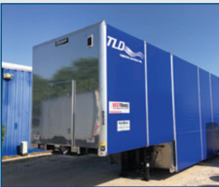
Dropdeck Vango - no midpoint connection