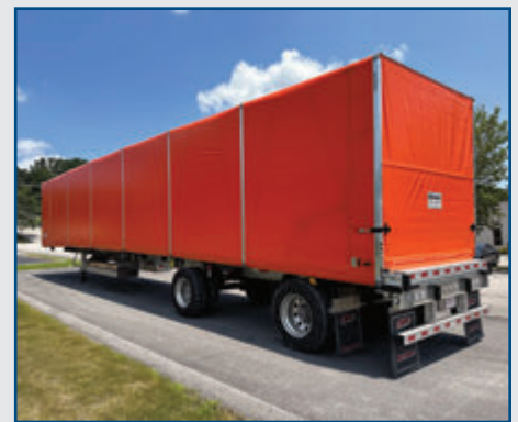
Make your Vango stand out with color!