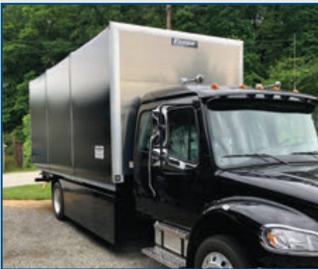
Straight Truck Vango